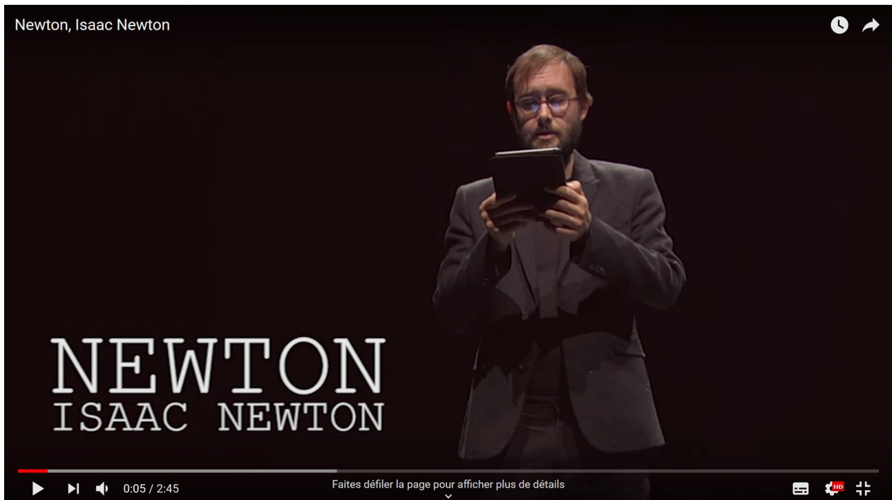
Le nouveau monde amoureux de Newton , art performance, Théâtre des Halles, Avignon, 2015