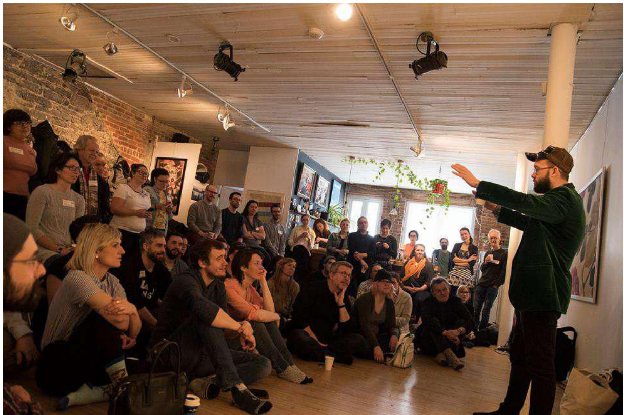
POETRY AND PARALLEL UNIVERSES, CONFERENCE, CREATIVE MORNINGS, QUEBEC, 2017