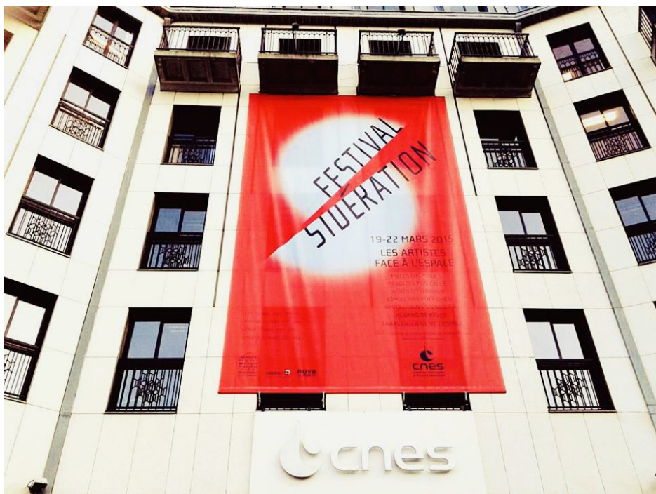
Poetry performances @ CNES Sideration Festival, Paris, 2015 and 2018