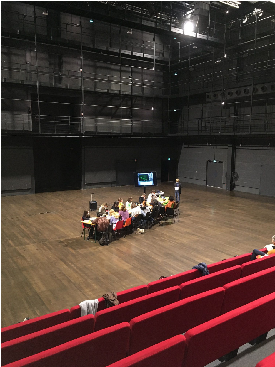
Writing workshop from outer space, FabricA, Festival d'Avignon, 2020